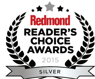
Redmond Reader's Choice Awards — Migration Tool

Quest helps our customers reduce tedious administration tasks so they can focus on the innovation necessary for their businesses to grow. Quest® solutions are scalable, affordable and simple-to-use, and they deliver unmatched efficiency and productivity. Combined with Quest's invitation to the global community to be a part of its innovation, as well as our firm commitment to ensuring customer satisfaction, Quest will continue to accelerate the delivery of the most comprehensive solutions for Azure cloud management, SaaS, security, workforce mobility and data-driven insight.